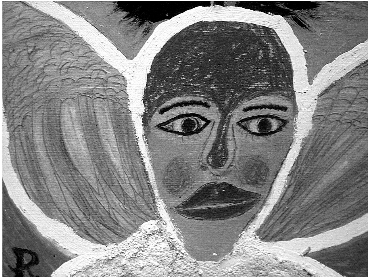
ART BY: RIGOBERTO

Each alcoholic's story is different, unique. Yet, as addiction slowly destroys them, pulling them closer to the PNR, everyone's story becomes the same. They drift into the current. As